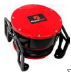
Length and angle measurements